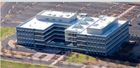
HUDSONALPHA INSTITUTE FOR BIOTECHNOLOGY

Opened in November 2007, HudsonAlpha is a $130 million project. The institute conducts research in biotechnology and partners with for-profit companies to develop new biotech products.