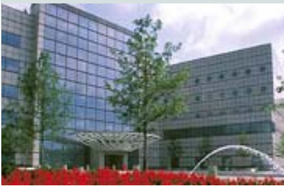
UAB HEALTH SYSTEM Medicine that touches the world.

The University of Alabama at Birmingham (UAB) is one of America's premier research universities, ranking 27th nationally in total federal research funding and attracting more than $400 million annually. UAB is home to one of the original NIH-designed Comprehensive Cancer Centers. The university's highly interdisciplinary, collaborative culture has a track record of producing groundbreaking research in the sciences, medicine and engineering.